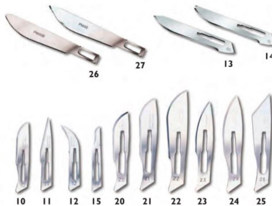
Figure 2 Scalpel Blades with the number