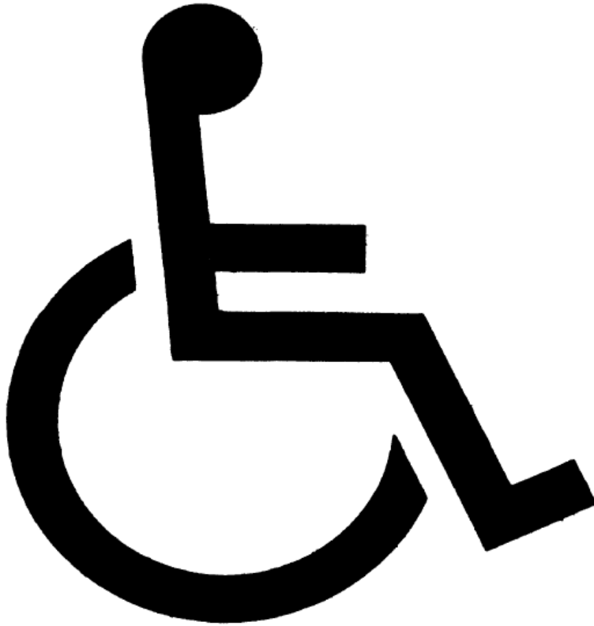
FIG. 2 SIGN OF CAUTION