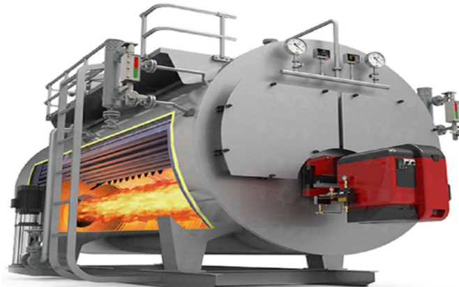
Fig. 2 A typical picture of Steam boilers

Boilers are closed vessels used to heat water to produce steam or hot water for industrial and power generation applications. They are commonly used in power plants, refineries, chemical industries and manufacturing processes, where steam is needed for heating, power generation, or processing. Since boilers operate at high pressure and temperature, proper design, operation, and maintenance are essential to ensure safe, efficient, and reliable performance.