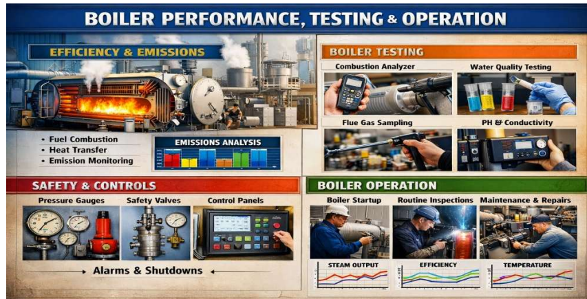
Fig. 4 A typical picture of Boiler Performance, Testing, and Operation