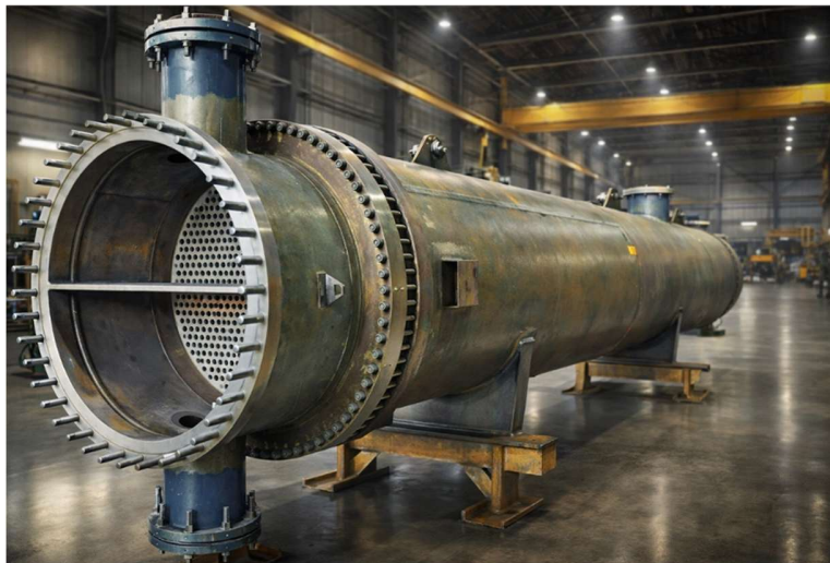
Fig. 3 A typical picture of Heat Exchangers

Heat exchangers are devices used to transfer heat from one fluid to another without mixing them. They are widely used in power plants, refineries, chemical plants, and other industrial processes for heating, cooling, condensation, and energy recovery. Heat exchangers help improve energy efficiency by utilizing heat from one process stream to heat or cool another. Proper design, material selection, and maintenance are important to ensure efficient heat transfer and reliable operation.